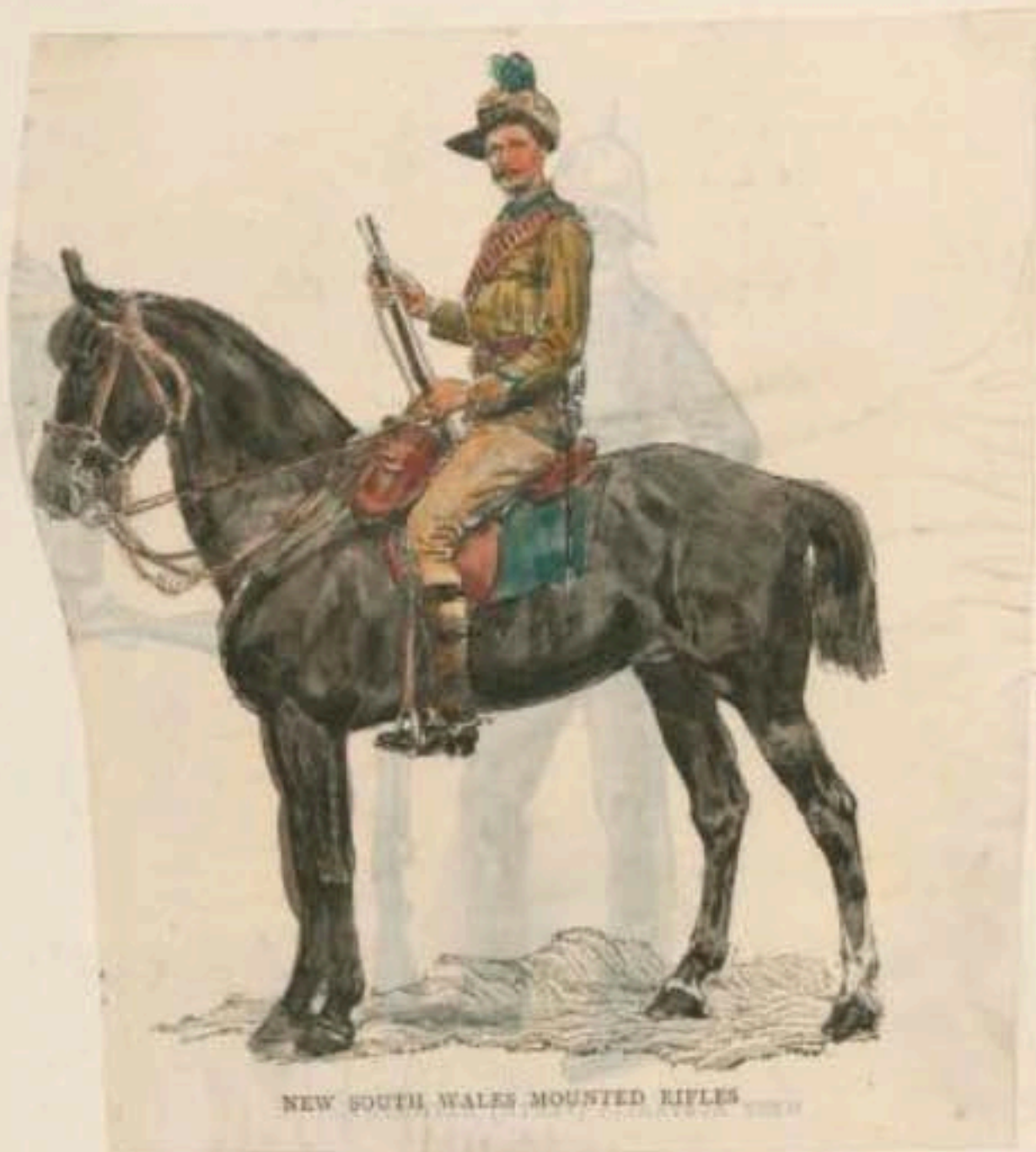
NEW SOUTH WALES MOUNTED RIFLES