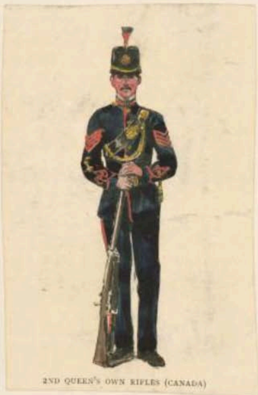
2ND QUEEN'S OWN RIFLES (CANADA)