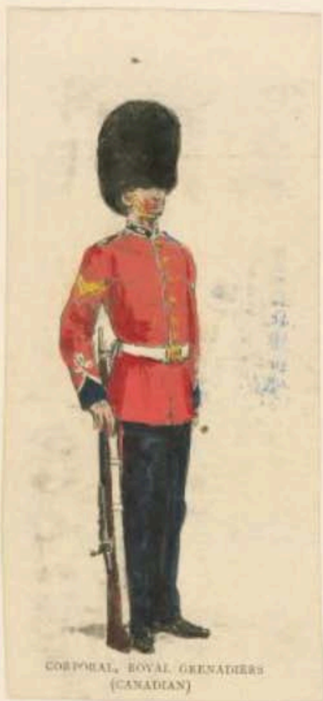
CORPORAL, ROYAL GRENADIERS (CANADIAN)