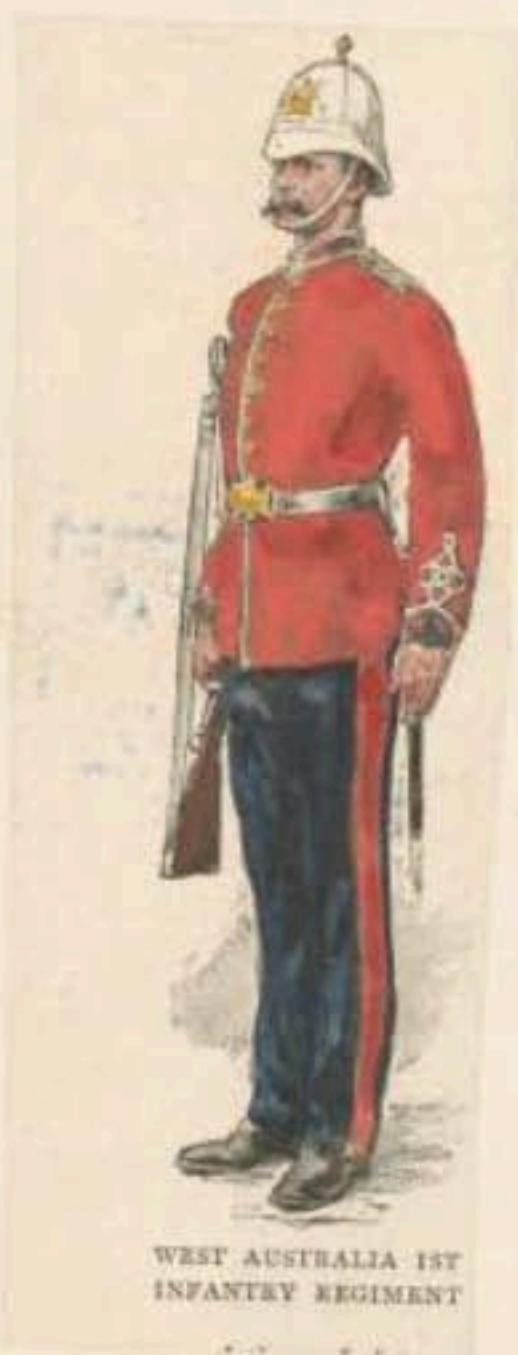
WEST AUSTRALIA 1ST INFANTRY REGIMENT