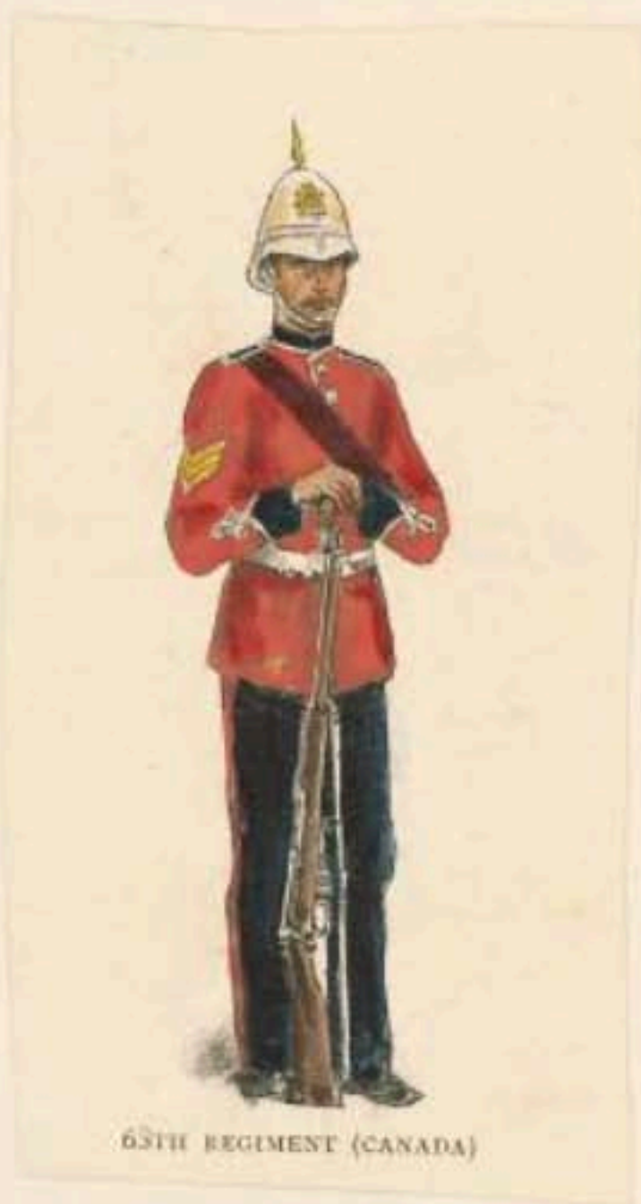
63TH REGIMENT (CANADA)