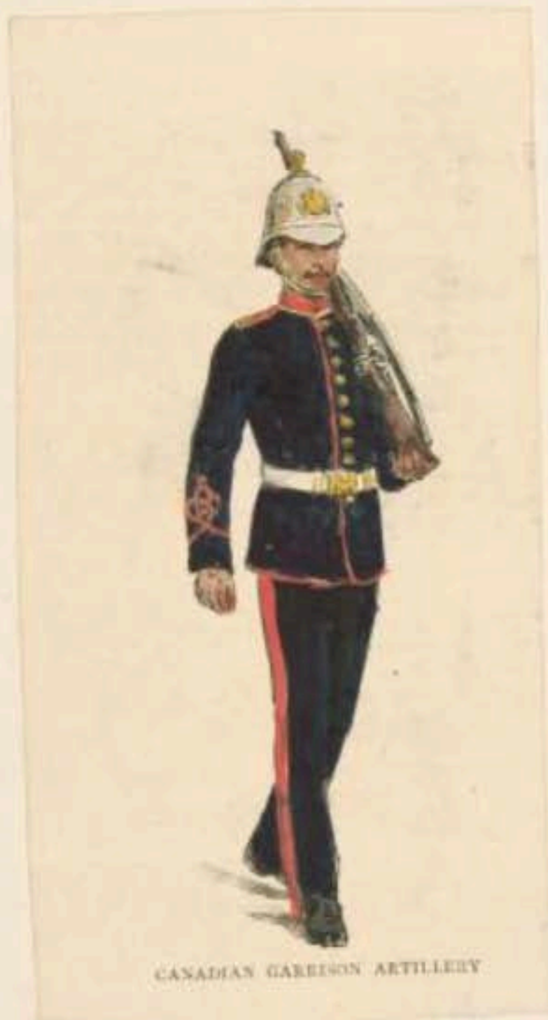
CANADIAN GARRISON ARTILLERY