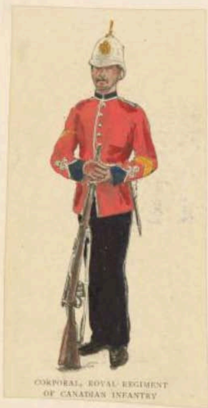
CORPORAL, ROYAL REGIMENT OF CANADIAN INFANTRY