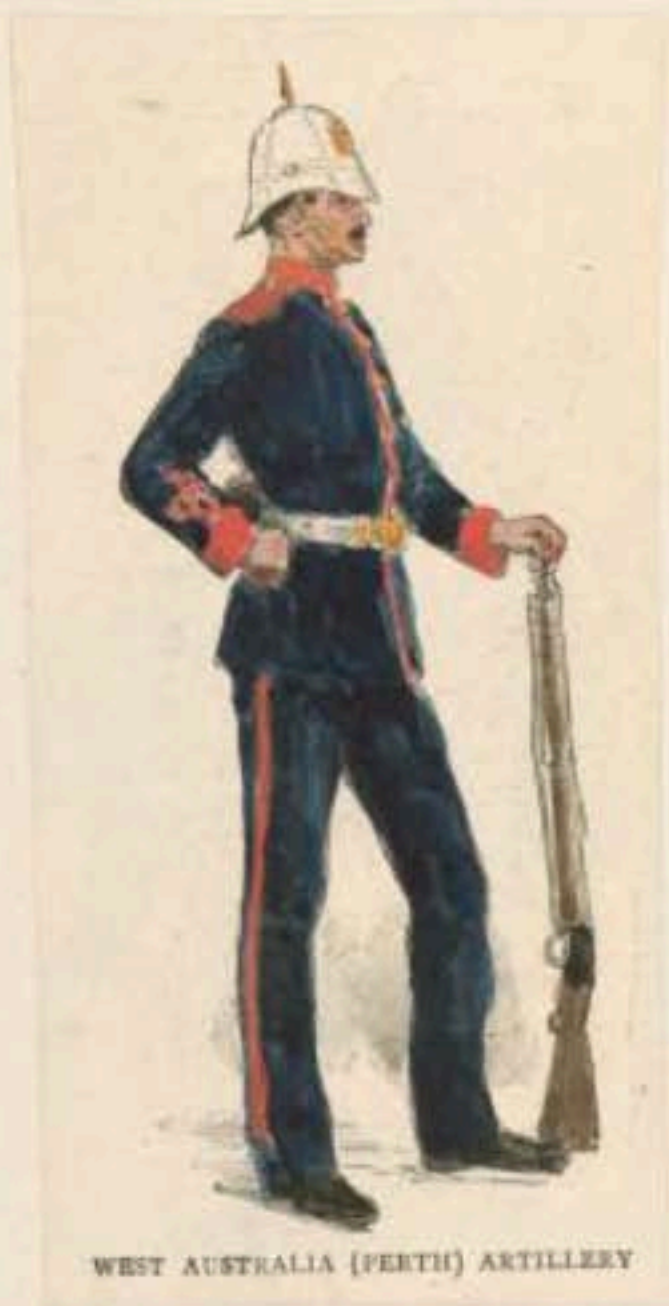
WEST AUSTRALIA (PERTH) ARTILLERY