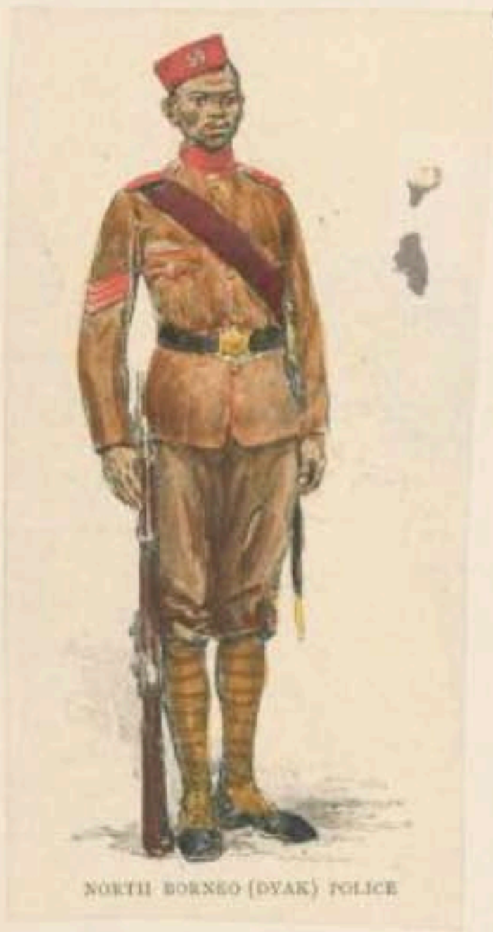
NORTH BORNEO (DYAK) POLICE