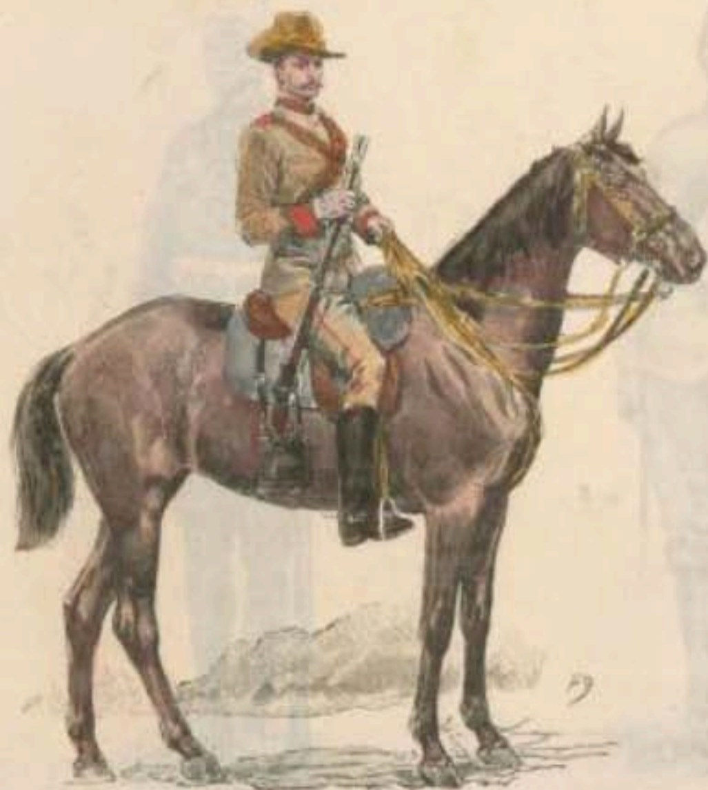
VICTORIA MOUNTED RIFLES