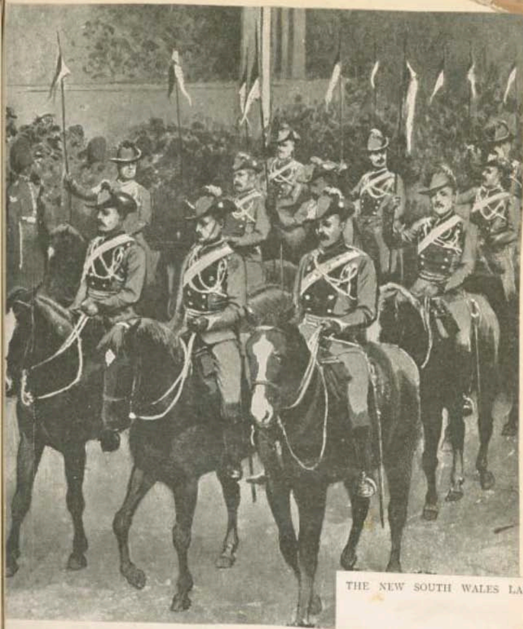
THE NEW SOUTH WALES LANCERS