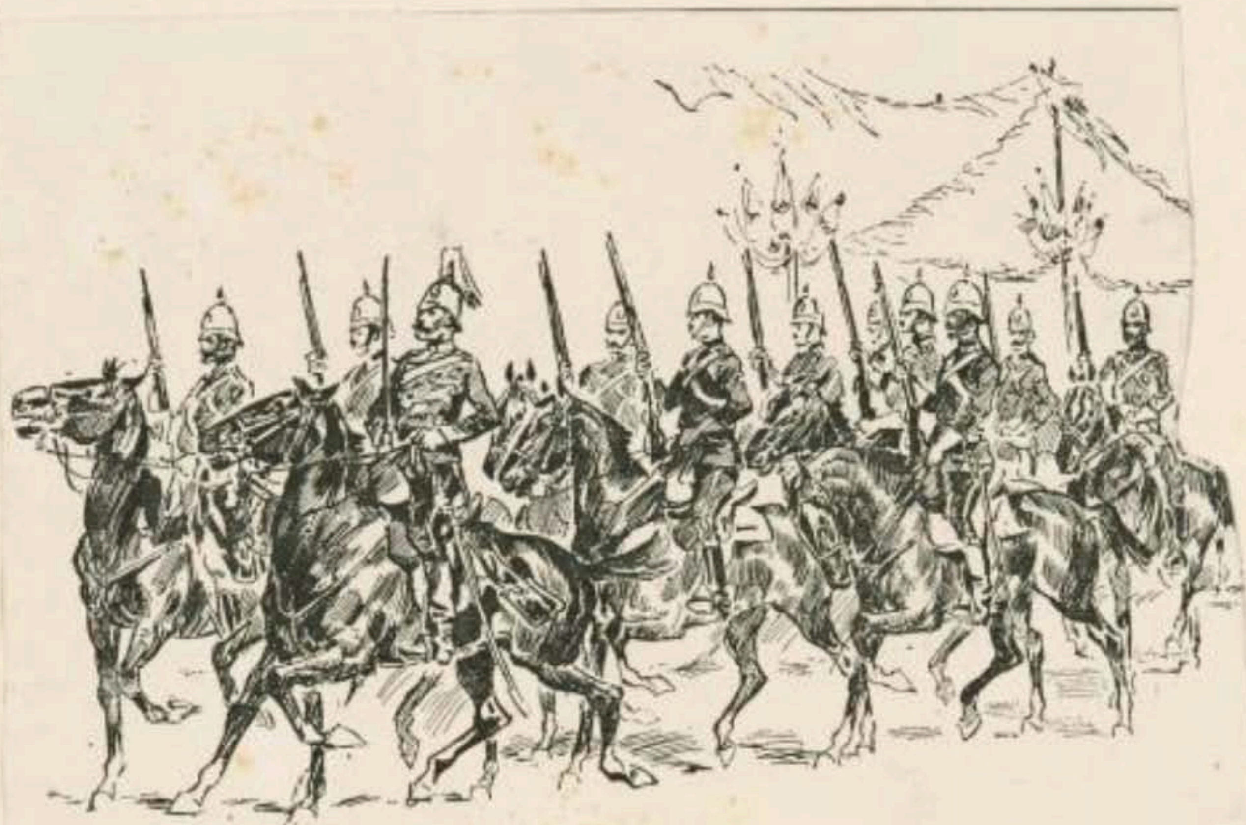
CANADIAN MOUNTED POLICE AND THE PREMIER OF CANADA