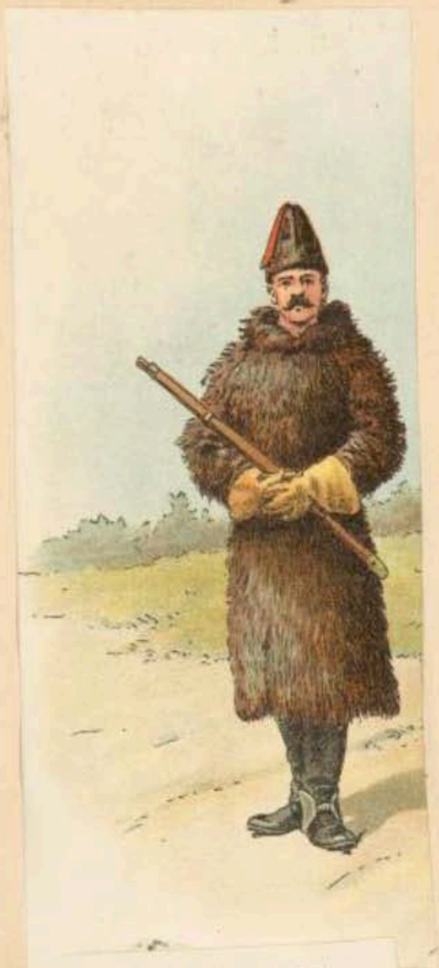
ROYAL CANADIAN DRAGOONS, Trooper, Winter Kit.