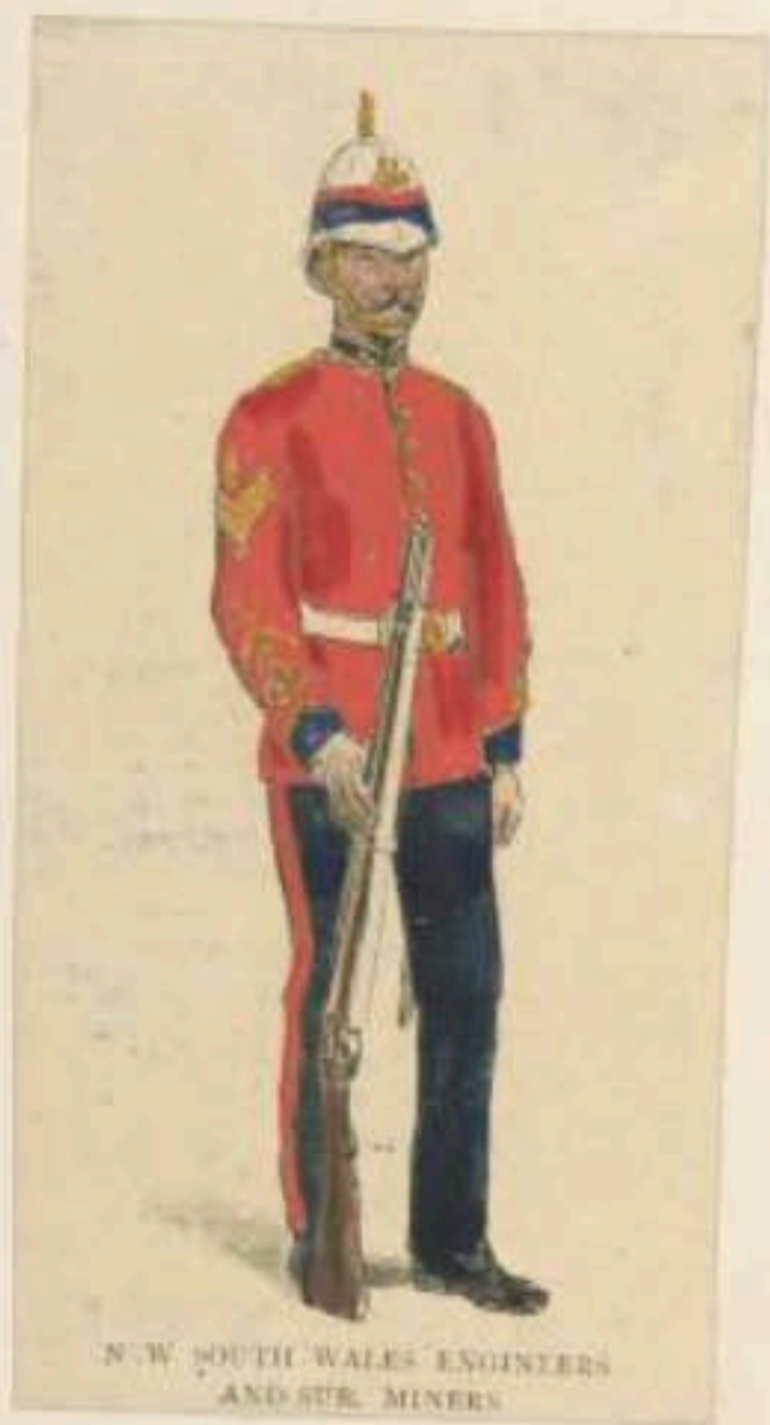
N.W. SOUTH WALES ENGINEERS AND STR. MINERS