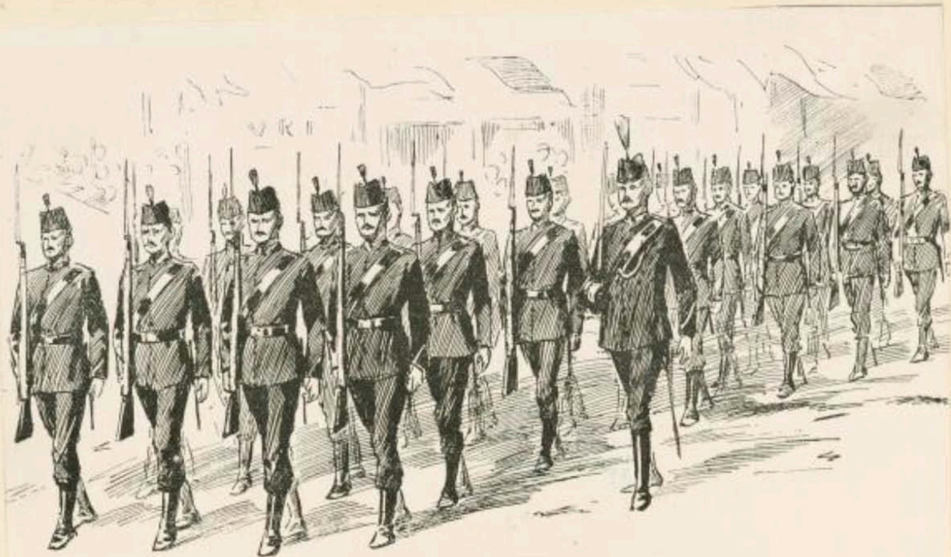
8th BATTALION ACTIVE MILITIA OF CANADA A portion of the Active Militia Force of Canada, maintained by voluntary enlistment