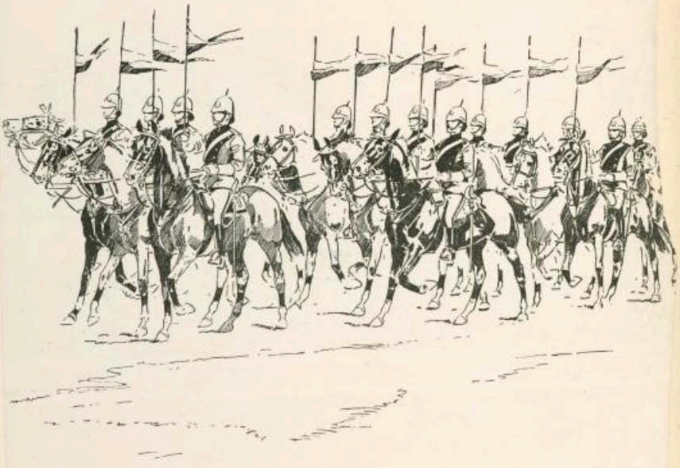
SOUTH AUSTRALIAN LANCERS