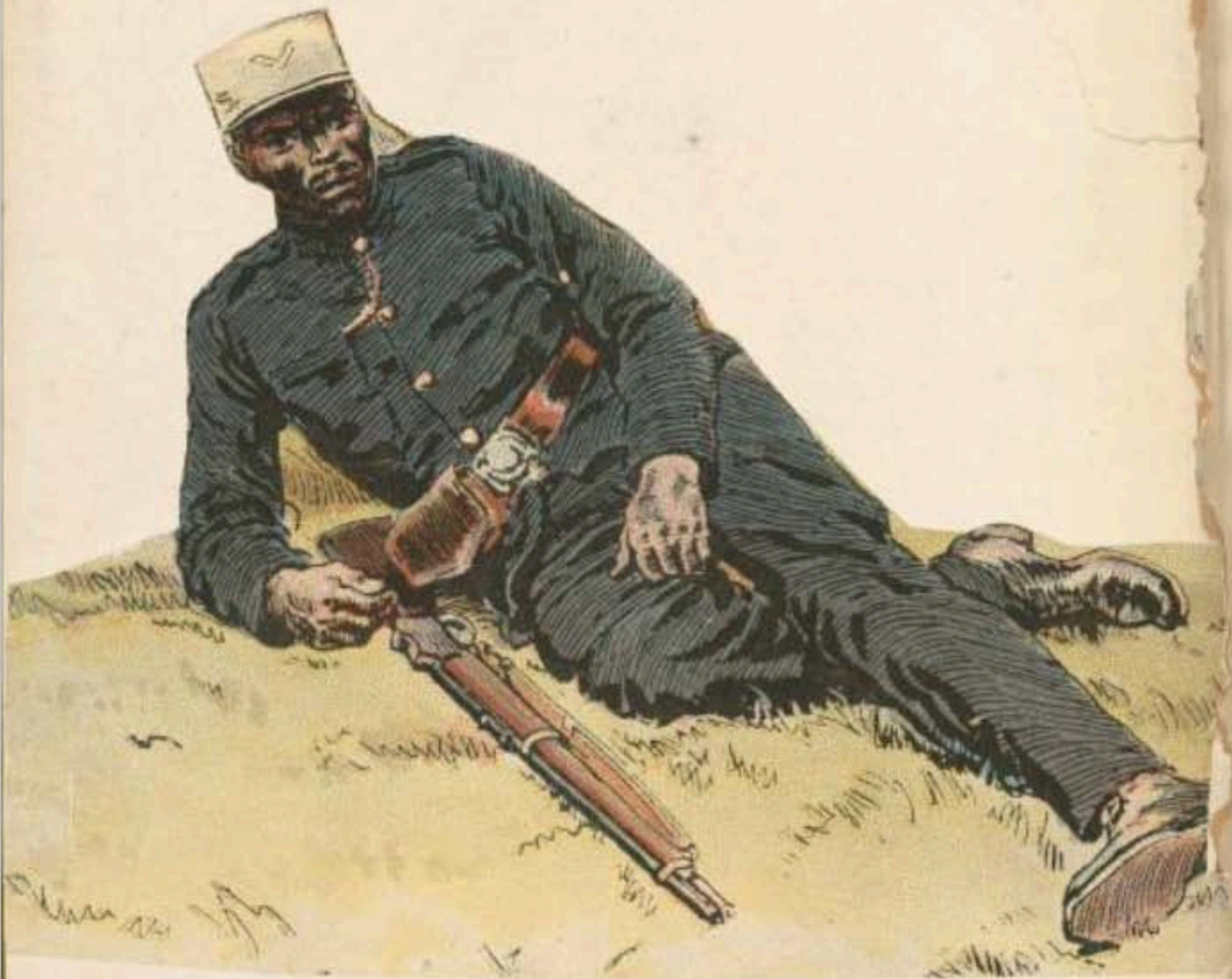
British Guiana Police