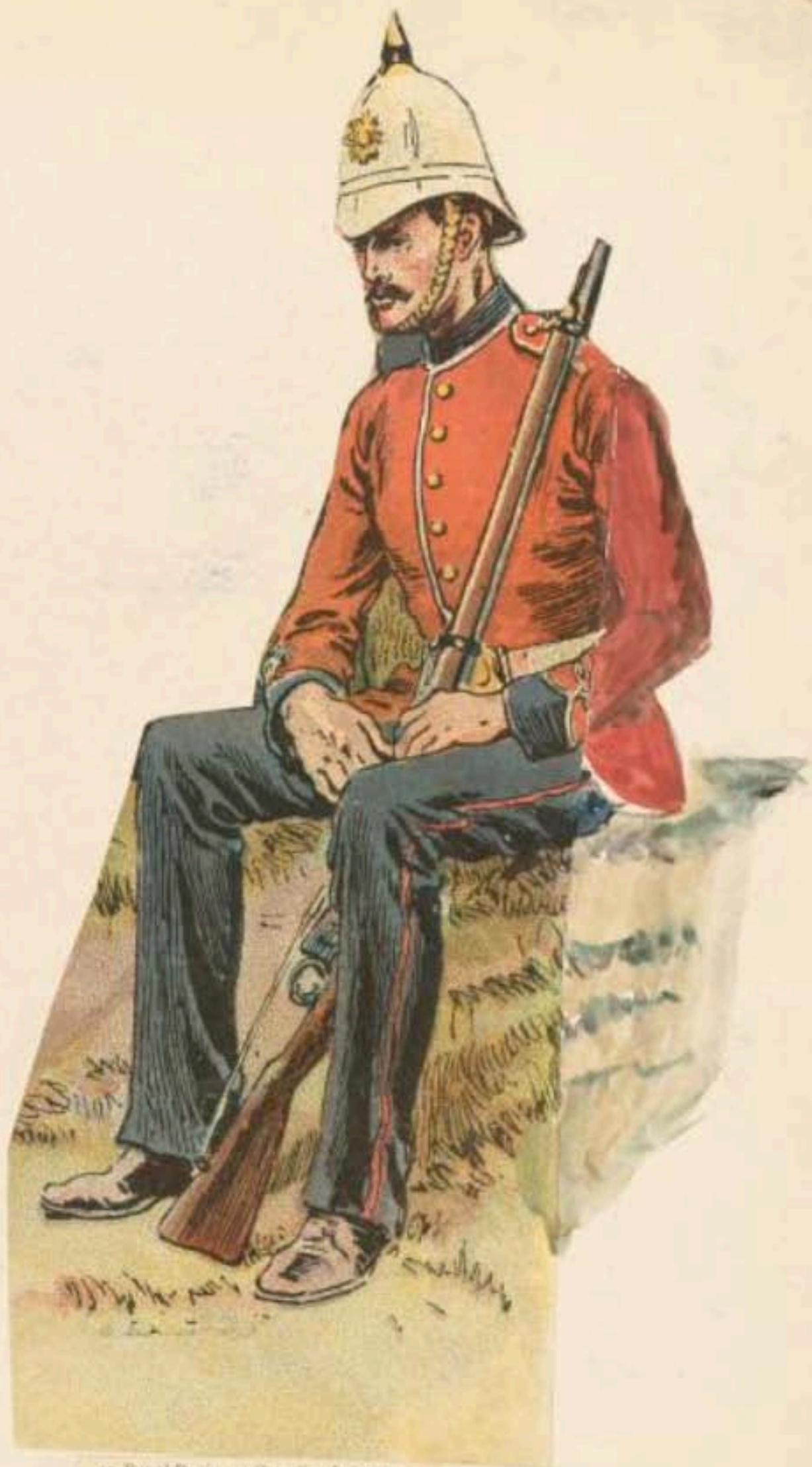
11. Royal Regiment Canadian Infantry