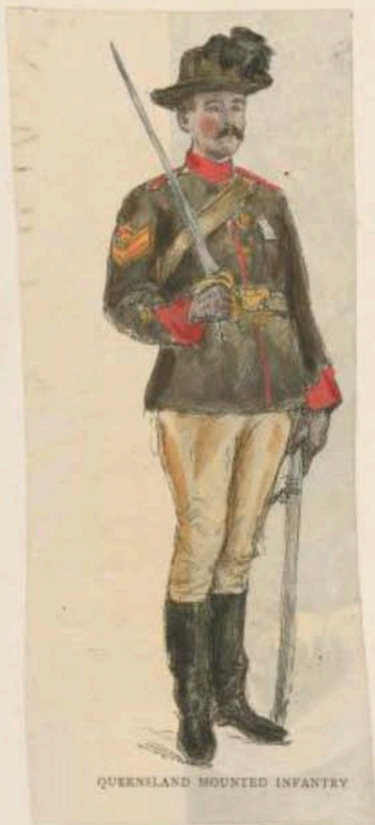
QUEENSLAND MOUNTED INFANTRY