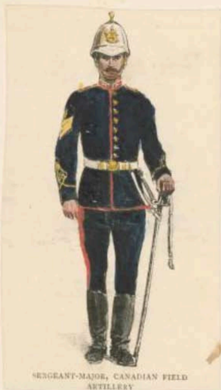
SERGEANT-MAJOR, CANADIAN FIELD ARTILLERY