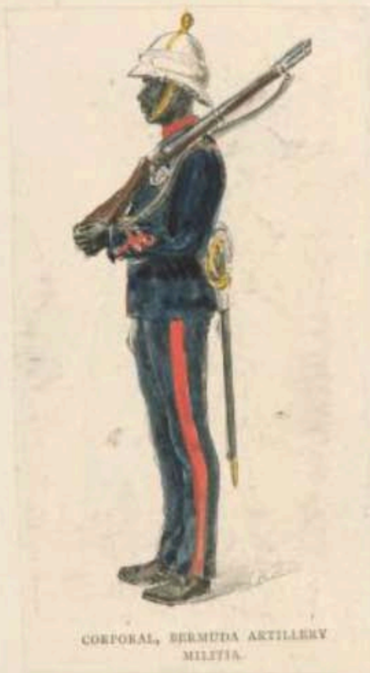
CORPORAL, BERMUDA ARTILLERY MILITIA