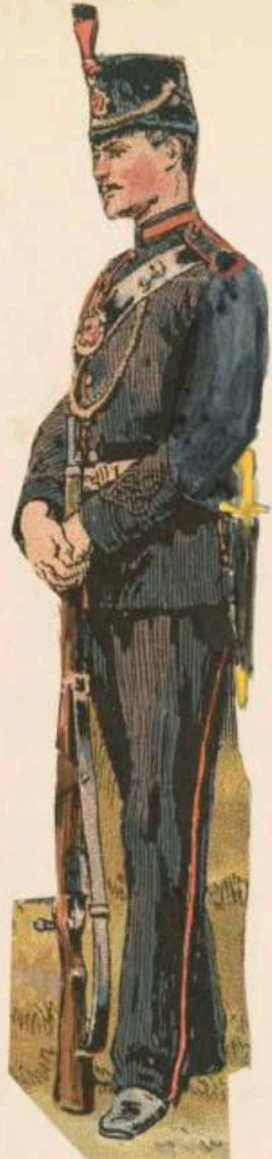
21 and Queen's Own Rifles (Canada)