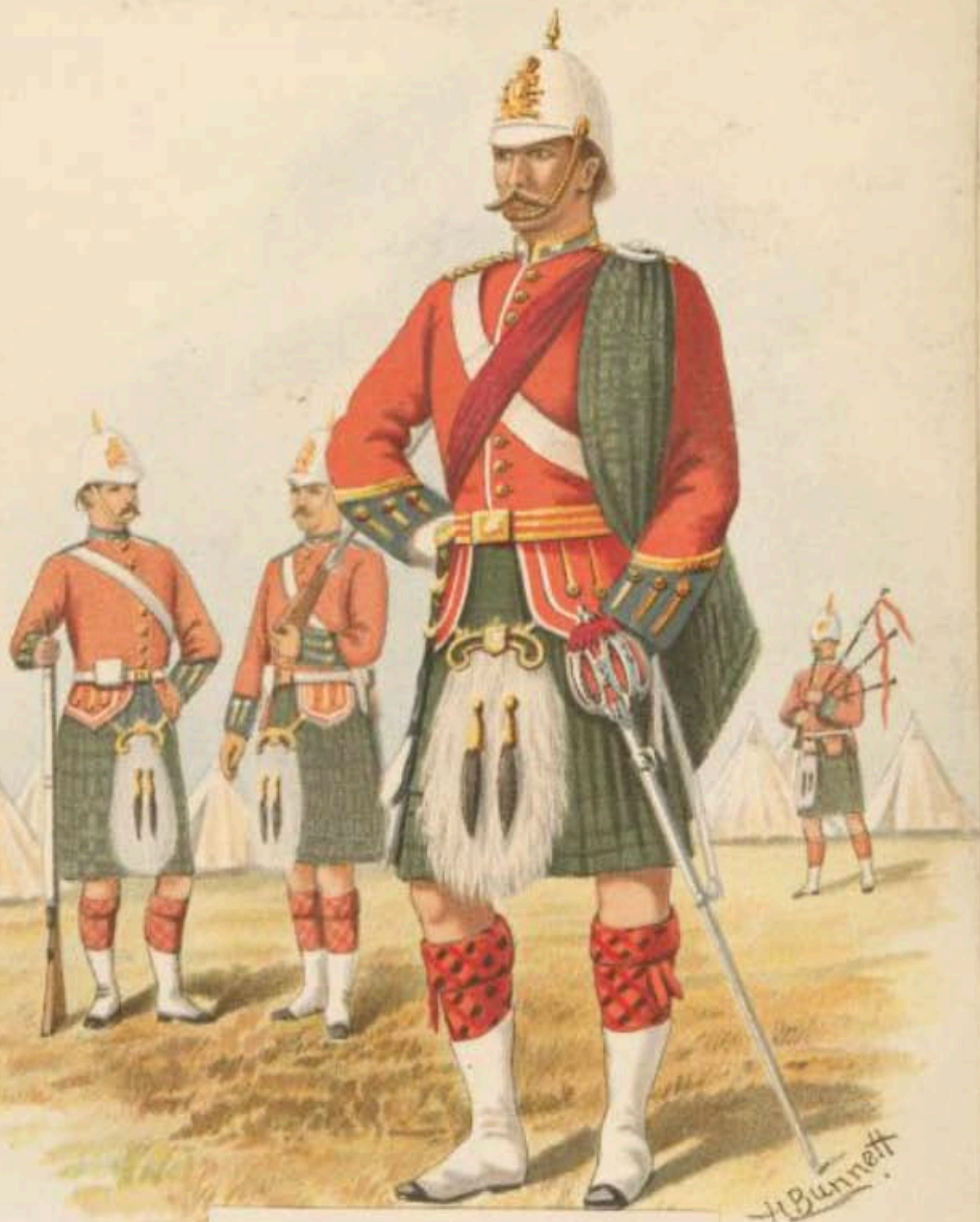
THE 5th ROYAL SCOTS OF CANADA, MONTREAL.