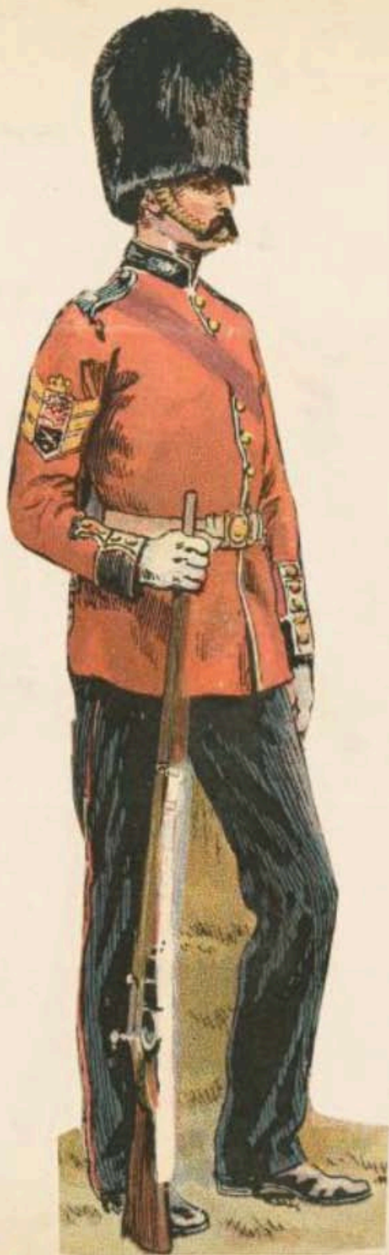
23 Governor-General's Foot-Guards (Canada)