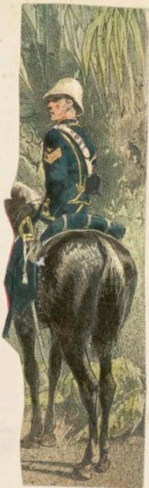
Ussaro volontario Principe di Gallar Provincia di Vittoria