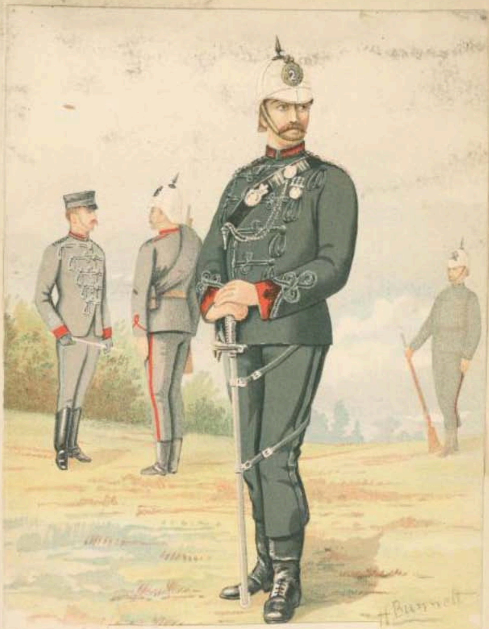
THE 2nd QUEEN'S OWN RIFLES (CANADA).