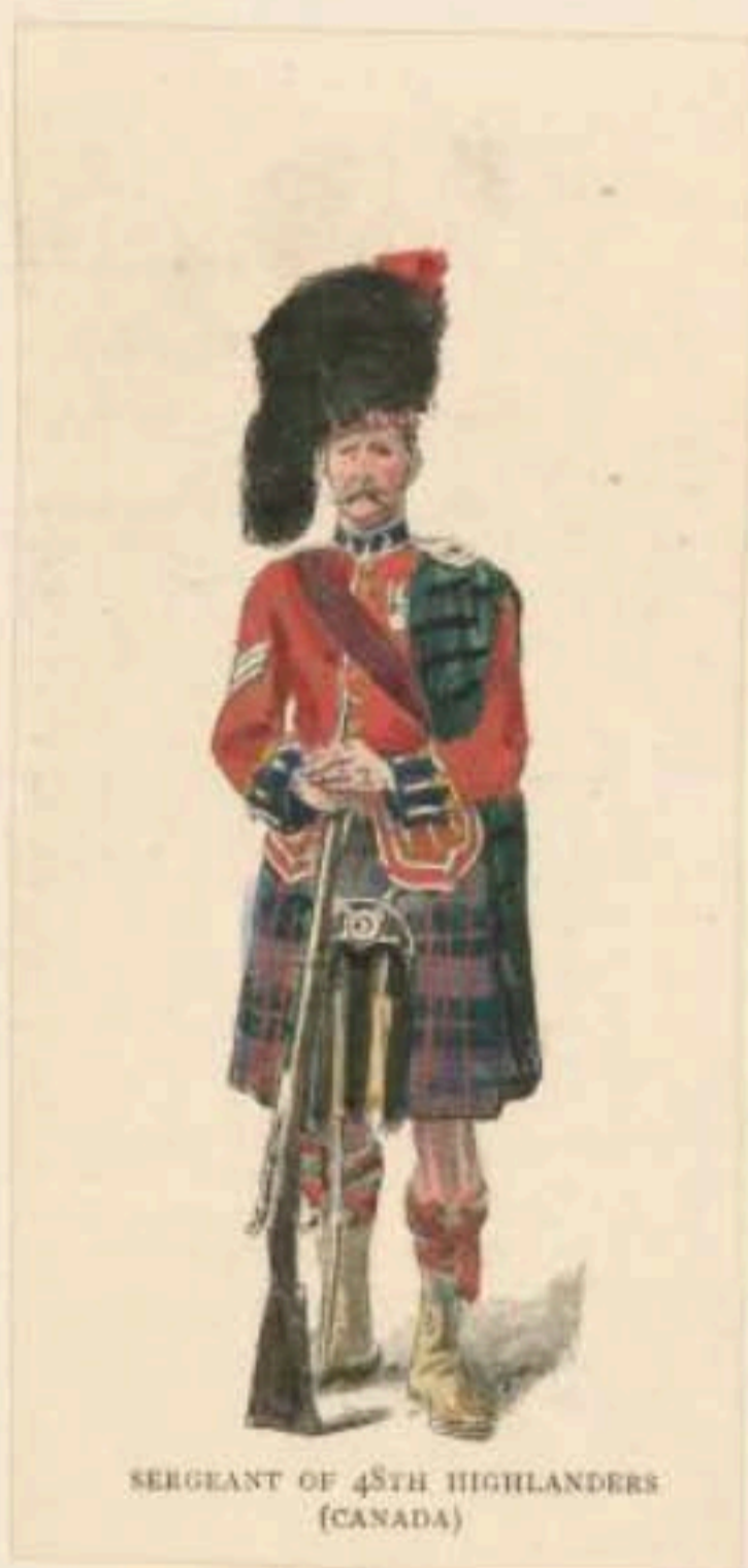
SERGEANT OF 48TH HIGHLANDERS (CANADA)