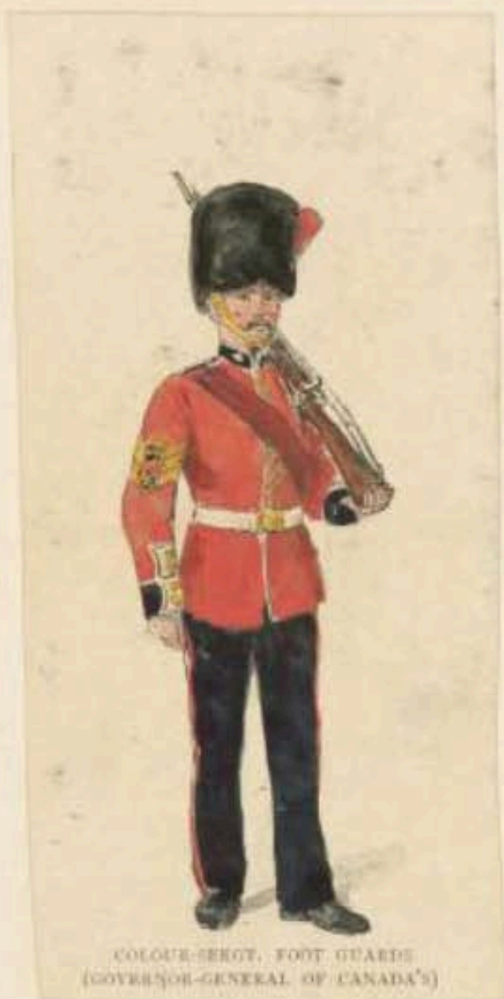
COLOUR-SERGEANT, FOOT GUARDS (GOVERNOR-GENERAL OF CANADA'S)