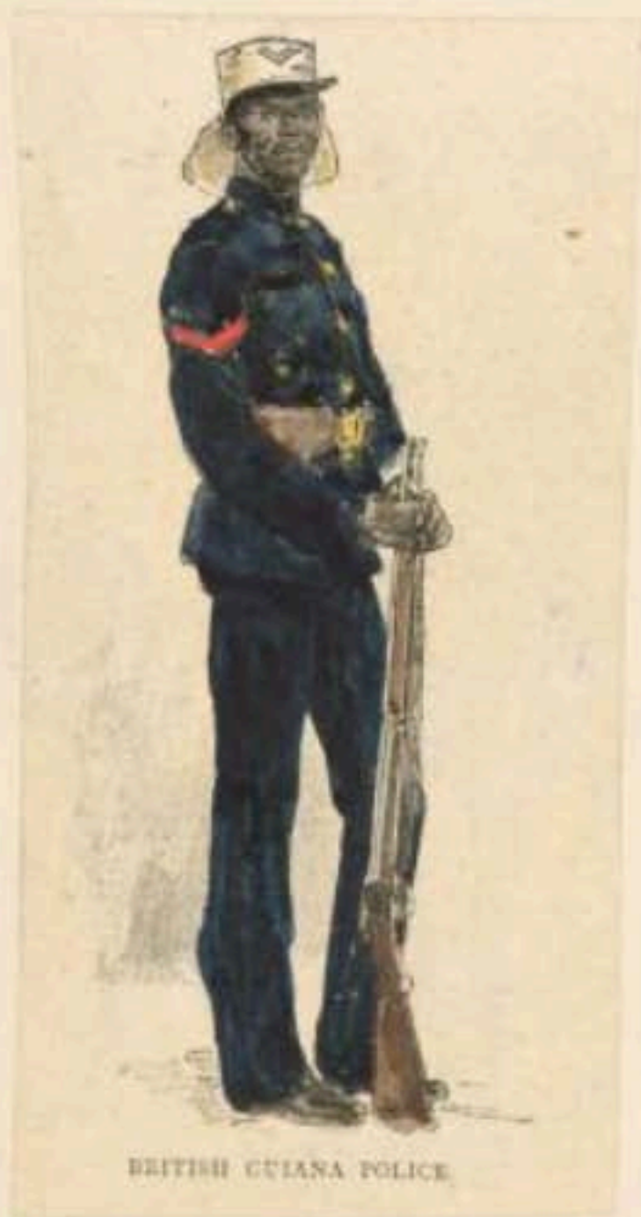
BRITISH GUIANA POLICE