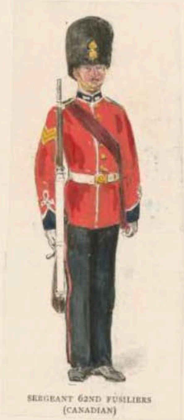
SERGEANT 62ND FUSILIERS (CANADIAN)