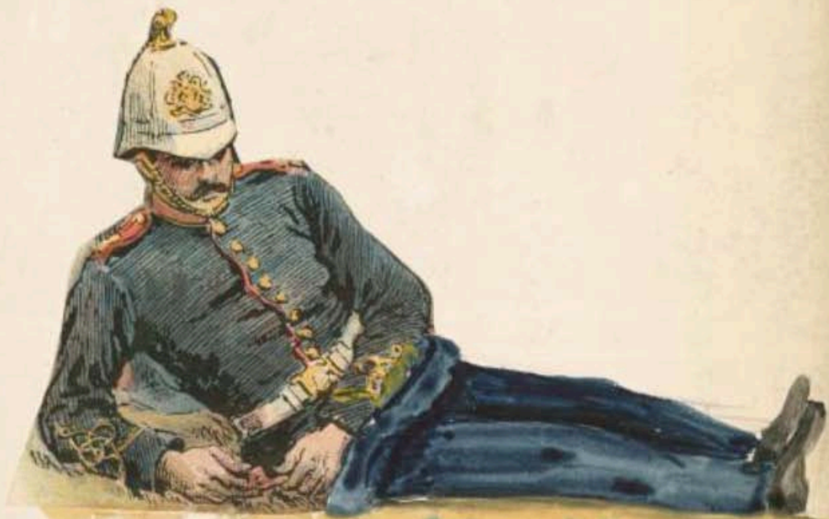
7 Garrison's Regt (Canada)