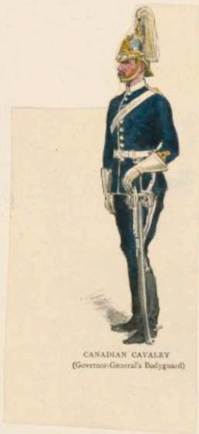
CANADIAN CAVALRY (Governor-General's Bodyguard)