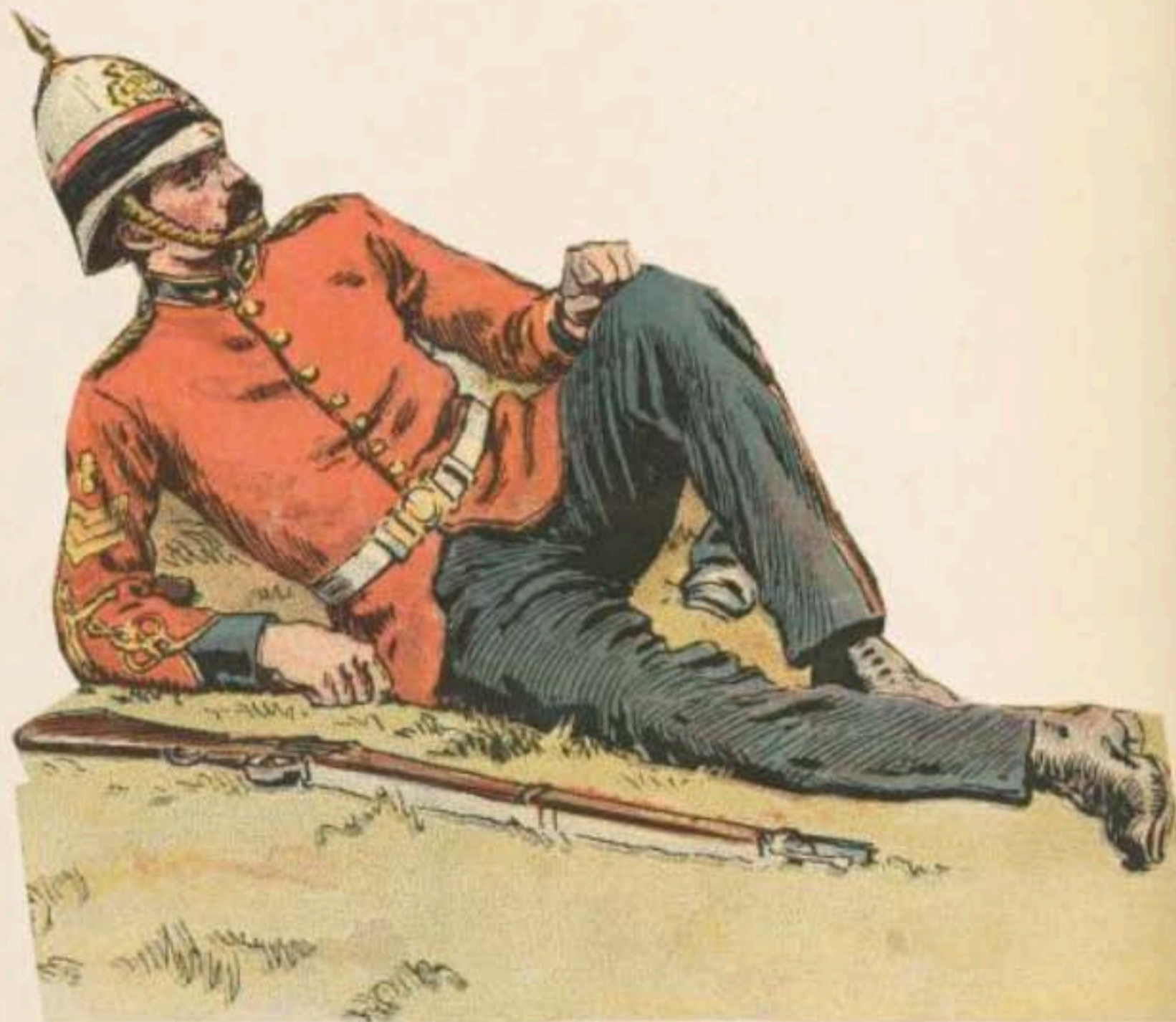
E New South Wales Engineers