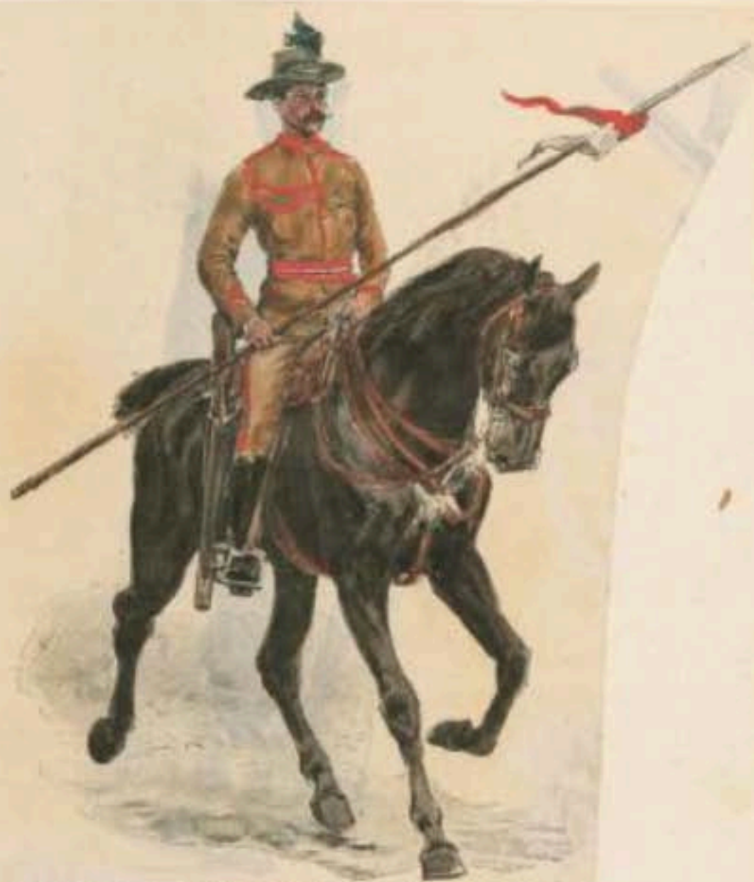
NEW SOUTH WALES LANCERS