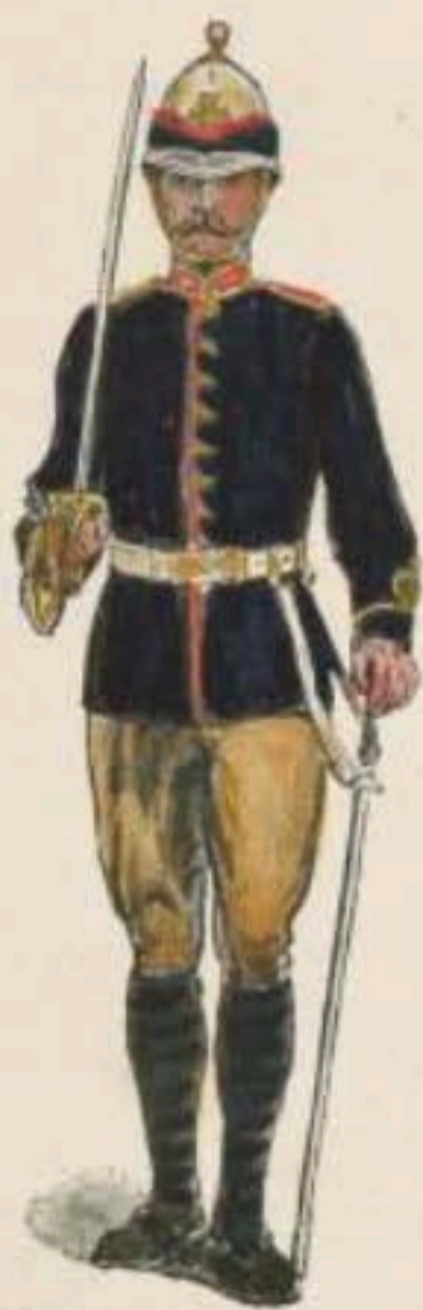
NEW SOUTH WALES FIELD ARTILLERY